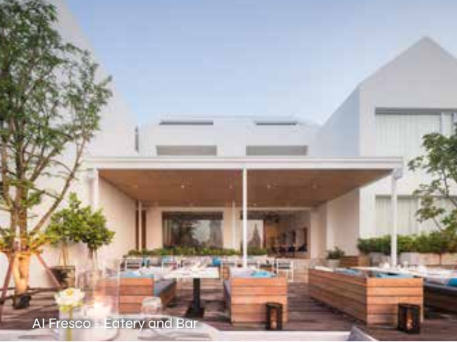
Al Fresco - Eatery and Bar