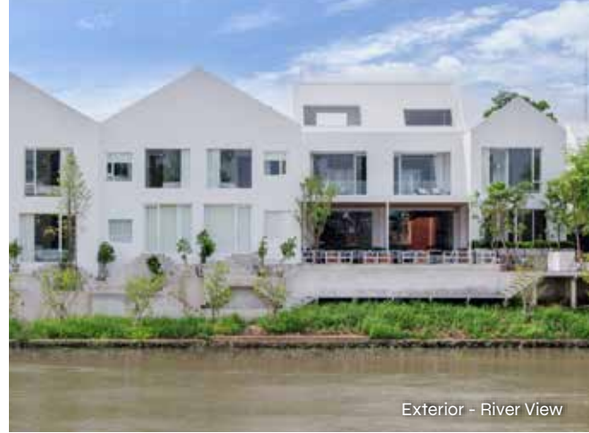
Exterior - River View

One Swimming Pool Eatery and Bar Rooftop Lounge & Bar An Art Gallery