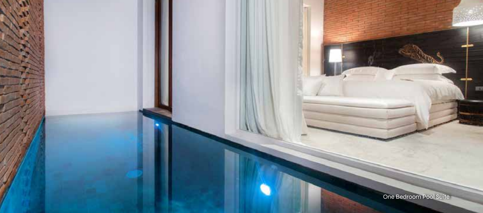
One Bedroom Pool Suite