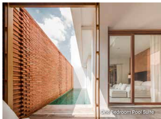
One Bedroom Pool Suite