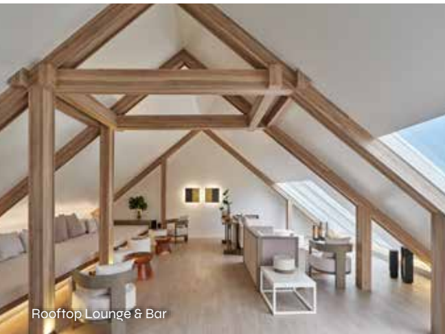
Rooftop Lounge & Bar