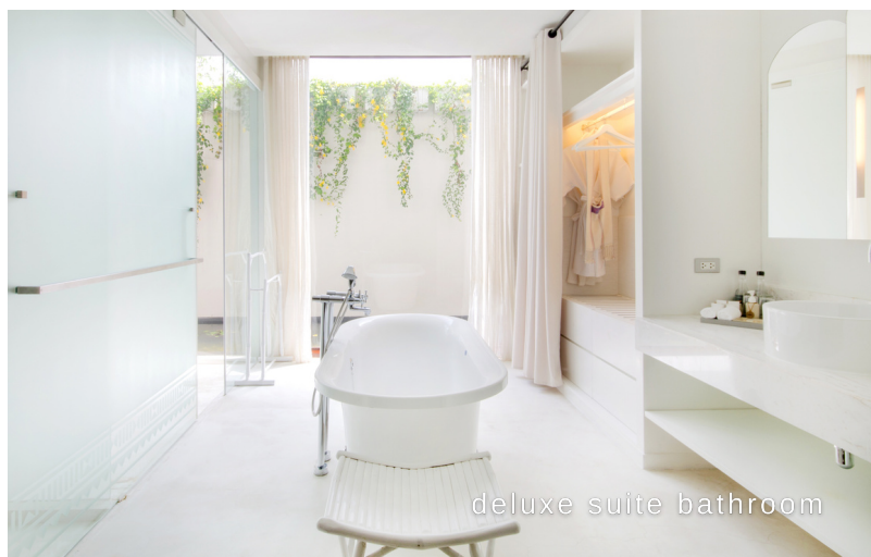
deluxe suite bathroom