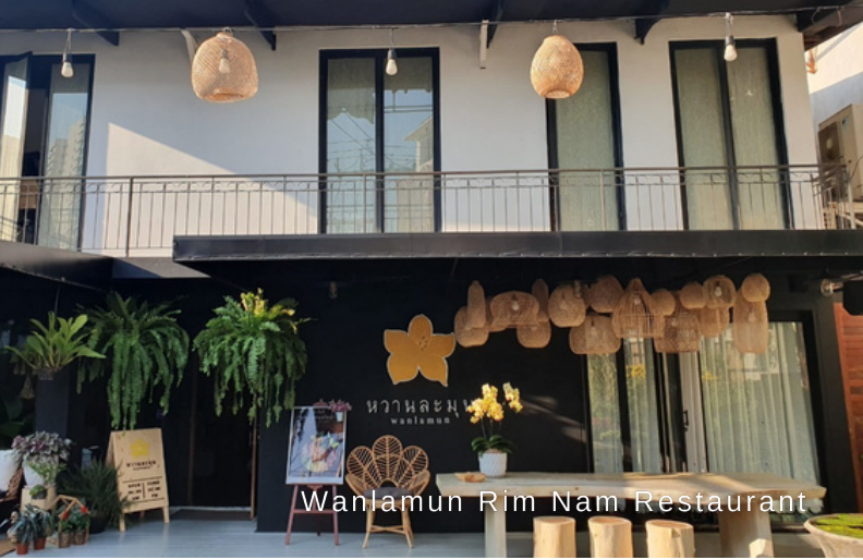
Wanlamun Rim Nam Restaurant