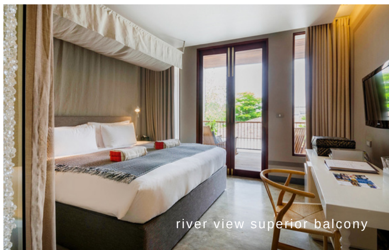
river view superior balcony